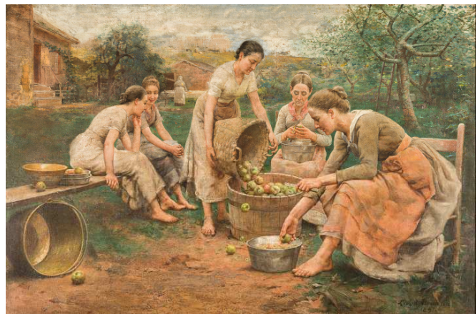
Women at Work, 1891, oil on canvas.